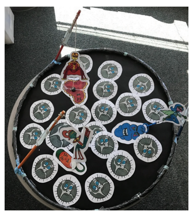
FIGURE 2. Example illustrating the set-up of the outreach activity. The diameter of the hula hoop in this photo is ~I meter with all heroes and villains printed full-scale from the appendices. This activity can be modified for smaller learning spaces by using a paper plate instead of a hula-hoop and reducing the size of the bacterial colonies and phage heroes accordingly.