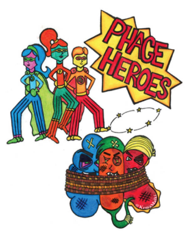
FIGURE I. The team of phage heroes conquering their bacterial villains (artwork by Kema Malki). This design can be used to make custom temporary tattoos to serve as a reward for successfully capturing the correct bacteria in the outreach activity.