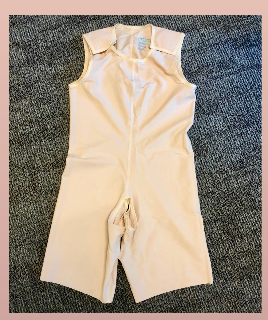
Marena Recovery MB2 Bodysuit

The purpose of this study is to compare the effectiveness and usability of alternative commercial abdominal compression garments with the usual medical device.