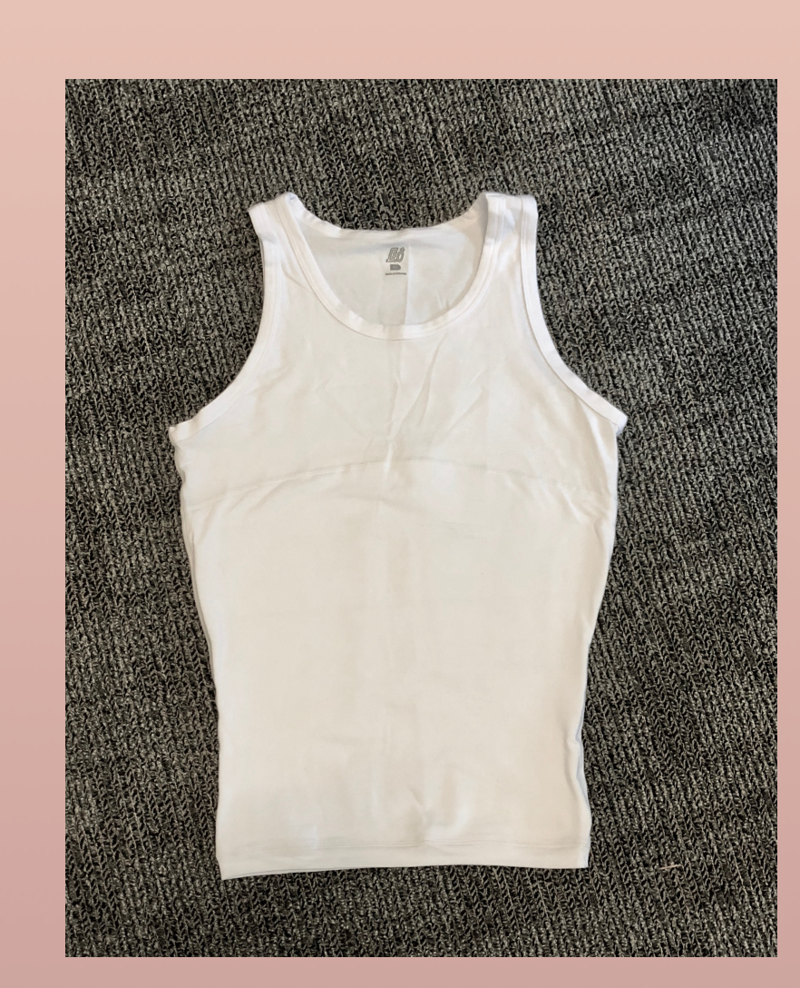
Leo by Leonisa Firm Compression Tank