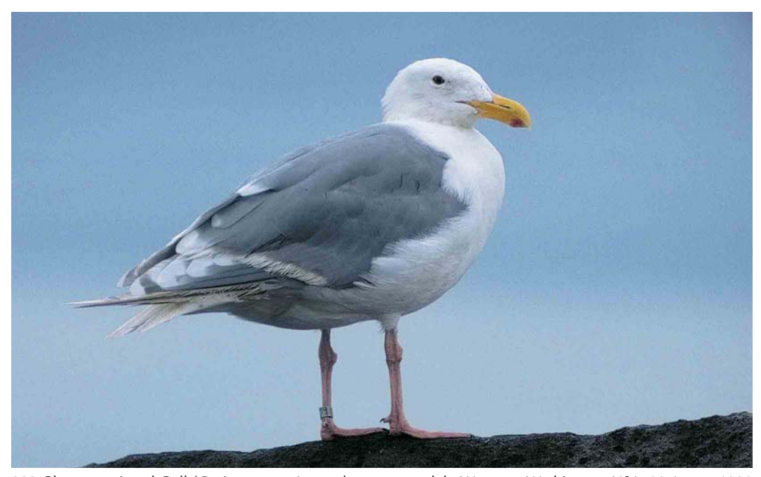
Identification and ageing of Glaucous-winged Gull and hybrids