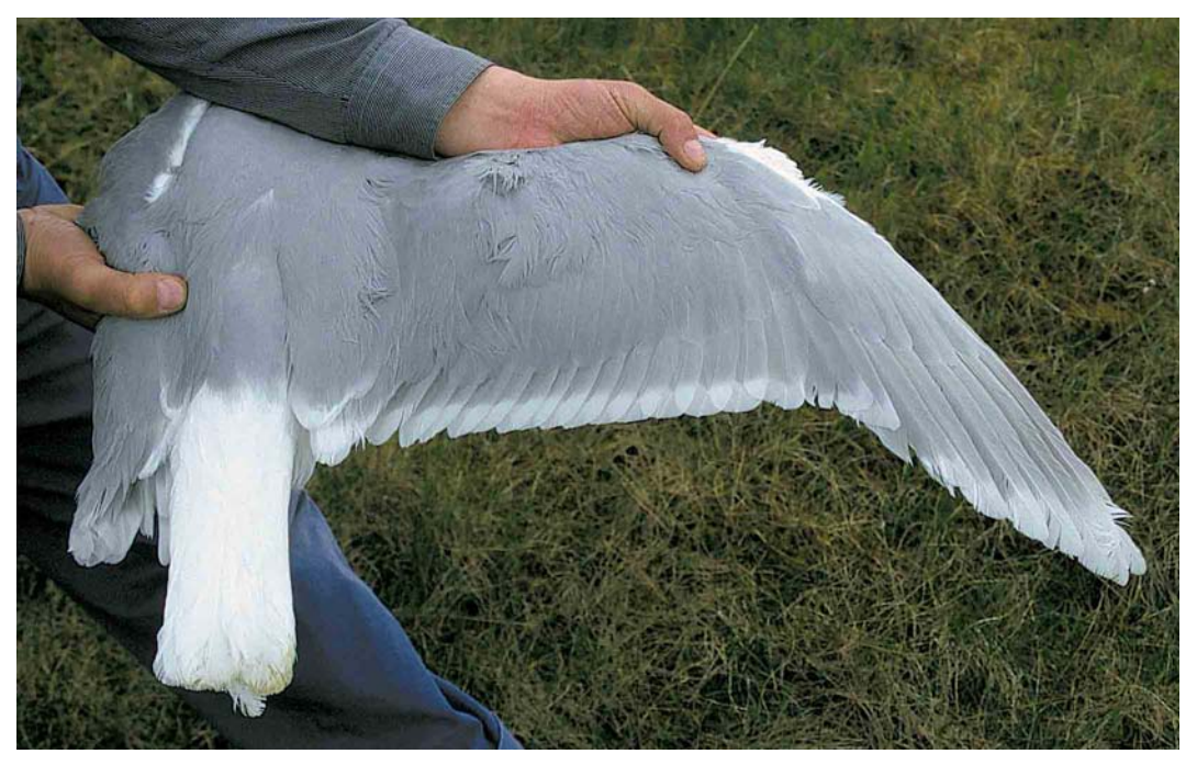
288 Presumed hybrid Glaucous x European Herring Gull / vermoedelijke hybride Grote Burgemeester x Zilvermeeuw Larus hyperboreus x argentatus , adult, probably female, Garðabær, south-western Iceland, 23 June 2001 ( Gunnar Thór Hallgrímsson ). This bird was paired with normal European Herring Gull and was probably a female as it was smaller than its mate. High degree of variation occurs in coloration of primaries and most presumed hybrids are very much like European Herring Gull in size and structure. Measurements of this bird strongly suggest European Herring Gull (Gunnar Thór Hallgrímsson in litt). Extremely pale-winged European Herring Gulls may occur in Iceland but total lack of darker grey pigmentation on primary-tips compared with rest of upperwing seems to exclude pure European Herring Gull