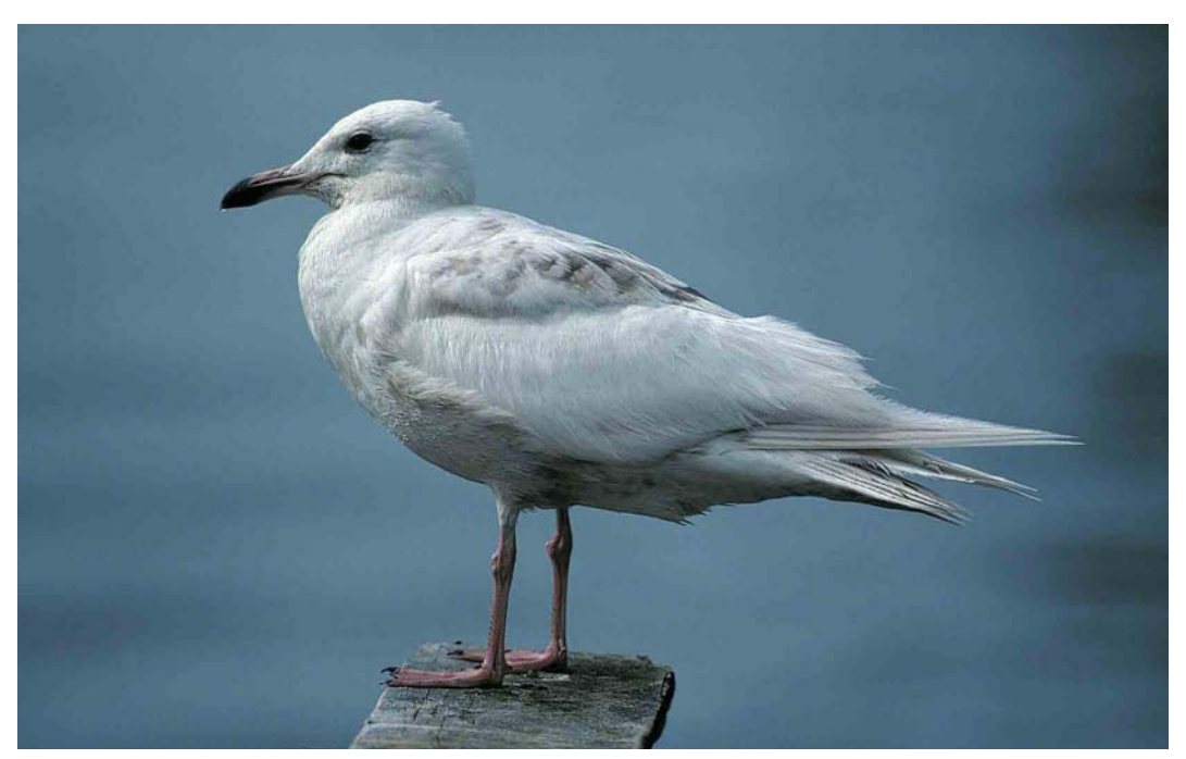
Identification and ageing of Glaucous-winged Gull and hybrids