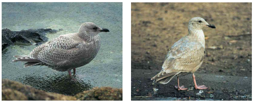
289 Glaucous-winged Gull / Beringmeeuw Larus glaucescens , first calendar-year, Faralllon Island, California, USA, 15 October 1997 ( Jon R King ). In fresh juvenile plumage as this bird, Glaucous-winged Gull can strongly resemble same-aged Thayer's Gull L glaucoides thayeri but note structure, especially head and bill shapes, more coarsely marked underparts and scapulars showing less white and obvious dark subterminal marks

290 Possible hybrid Glaucous-winged x American Herring Gull / Beringmeeuw x Amerikaanse Zilvermeeuw Larus glaucescens x smithsonianus , presumed first calendar-year, Lake Merritt, Oakland, Alameda County, California, USA, 15 November 1996 ( Jon R King ). Probably, best left unidentified but pink on bill, pattern on wing-coverts, bill and head shapes and relative darkness of primaries suggest this is not pure Glaucous-winged Gull