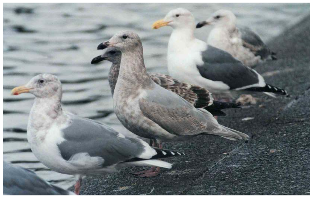
309 Glaucous-winged Gull / Beringmeeuw Larus glaucescens, third calendar-year (centre), with hybrid Glaucouswinged x Western Gull / Beringmeeuw x Californische Meeuw L glaucescens x occidentalis, adult (left) and Western Gulls (second calendar-year, behind, adult, right, and third calendar-year, far right), Petaluma, Sonoma County, California, USA, 12 January 1998 (Jon R King). Note intermediate grey upperparts and dark grey (not black) primaries of hybrid

Palearctic records (on El Hierro, Canary Islands) concerned a bird presumed to be in third-winter plumage. Structural features are very much comparable at all ages and may therefore be studied in immatures as well to learn the distinctive characters of Glaucous-winged Gull of any age. The text below summarizes the main characters of immature plumage, and is based on Harrison (1983), Snow & Perrins (1998) and Sibley (2000). The accompanying photographs illustrate most plumage stages of pure Glaucous-winged Gulls and several hybrid-types which may cause confusion. The principal identification points are discussed in the captions.