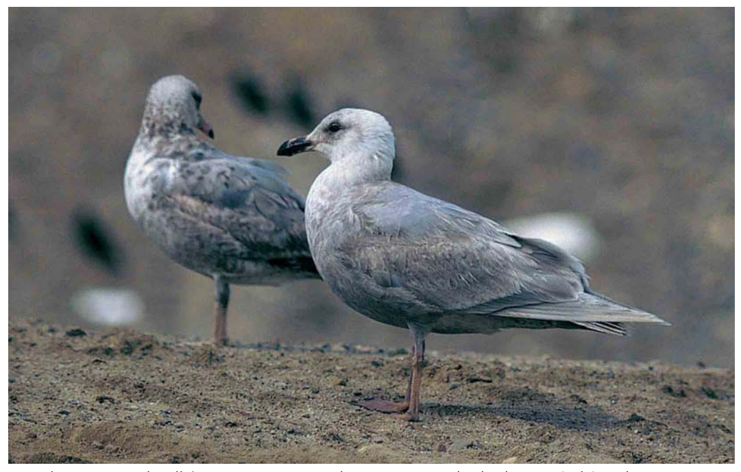
305 Glaucous-winged Gull / Beringmeeuw Larus glaucescens, second calendar-year, (right), with American Herring Gull / Amerikaanse Zilvermeeuw L smithsonianus, subadult, Santa Barbara, California, USA, March 1982. Bird in second-winter plumage. Note overall plain-looking plumage and adult-type pale grey mantle-feathers. Head rather small and rounded and bill not very heavy, possibly indicating female

306 Glaucous-winged Gull / Beringmeeuw Larus glaucescens, second calendar-year, Vancouver, British Columbia, Canada, 15 June 2000. Relatively dark bird. Two generations of scapulars are visible