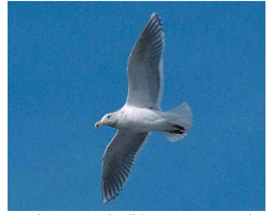
286 Glaucous-winged Gull / Beringmeeuw Larus glaucescens, adult, Nosappu Misaki, Hokkaido, Japan, 5 February 1999 (Jon R King). Note extensive white tongue on primaries up to p9 which can be feature of hybrids

Typical Glaucous-winged Gulls are rather large and bulky, with a heavy bill, marked gonydeal angle, heavy head, thick body and short primary and wing projections. The wings are rather broad and slightly more rounded than in most Palearctic large gulls while the outer primaries are rather more curved. In addition, the secondaries are relatively longer than in many other Palearctic large gulls (except Western Gull), resulting in a broad, often rather shortish-looking wing. Hence, when perched, the folded wing often looks broad, with the secondaries and/or the bases to the outer primaries often well visible (sometimes the full bases to as many as four or five outer primaries can easily be seen), and the secondaries often project beyond the greater wing-coverts. Two or three primary-tips extend beyond the tail. Palearctic large gulls normally show a slimmer folded-wing structure (cf Garner & McGeehan 1998). Note however that any Palearctic large gull may, at times, adopt a posture in which it reveals more of its secondaries and/or primary-bases than usual. Nevertheless, this is normally just a temporary function of wing