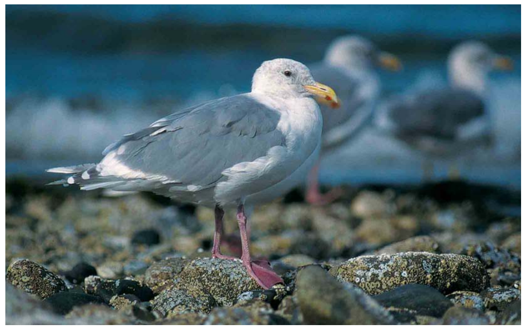
Glaucous-winged Gull / Beringmeeuw Larus glaucescens, adult, Monterey, California, USA, 10 October 1991. Note small dark eye and long, slightly drooping, bill

Glaucous-winged Gull / Beringmeeuw Larus glaucescens , adult, Vancouver Island, British Columbia, Canada, September 1998 . Note small dark eye, typical scalings on head, neck and breast and strong, deep pink legs. Outer primaries are missing