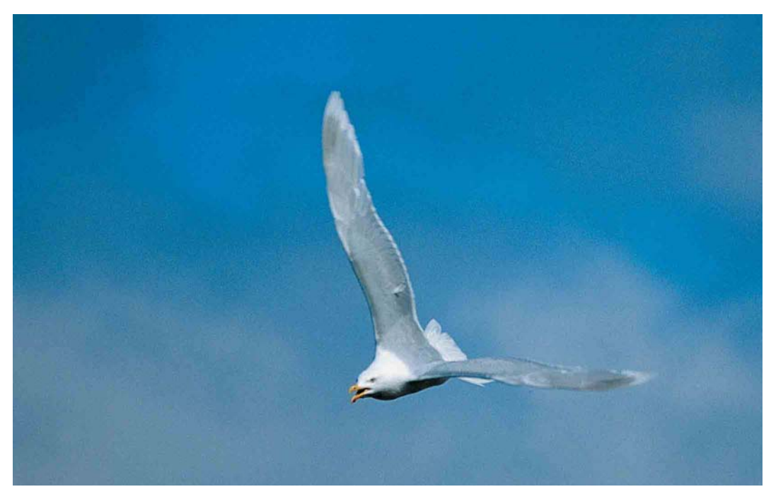
Identification and ageing of Glaucous-winged Gull and hybrids