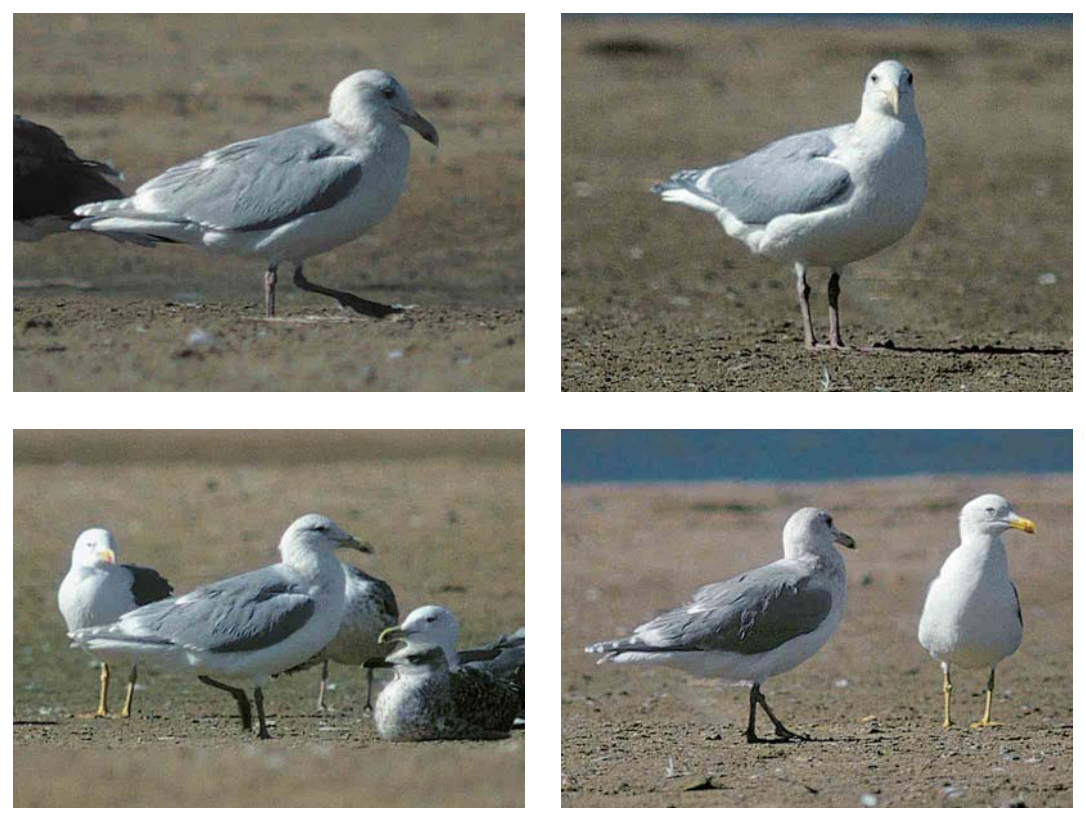
322-324 Glaucous-winged Gull / Beringmeeuw Larus glaucescens, adult winter, Essaouira, Morocco, 31 January 1995 (Theo Bakker/Cursorius) 325 Glaucous-winged Gull / Beringmeeuw Larus glaucescens, adult winter (left), with Yellow-legged Gull / Geelpootmeeuw L michahellis, Essaouira, Morocco, 31 January 1995 (Theo Bakker/Cursorius)

\ensuremath{\mathsf{UNDERPARTS}} White. No darker wash or markings on side of breast.