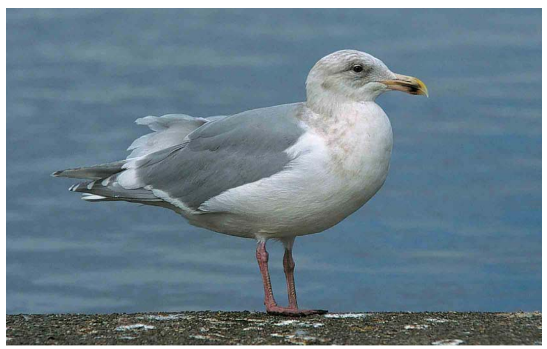
318 Glaucous-winged Gull / Beringmeeuw Larus glaucescens , probably fifth calendar-year, Petaluma, Sonoma County, California, USA, 5 March 1999 ( Jon R King ). As adult but with reduced white in primaries and with large black bill-markings

319 Presumed hybrid Glaucous-winged x Western Gull / vermoedelijke hybride Beringmeeuw x Californische Meeuw Larus glaucescens x occidentalis , third calendar-year, Portland, Oregon, USA, October 1991 ( René Pop ). Note very dark grey primary-tips and dark mantle, probably too dark for Glaucous-winged Gull; extensive scaling on head and breast and dark bill indicative of Glaucous-winged parentage. Small white tips on primaries, dull pinkish legs and dark bill point towards third-winter plumage; adult would show more white in wing, as well as yellow bill and brighter legs