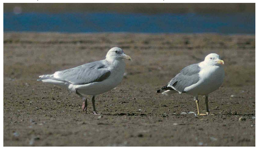
321 Glaucous-winged Gull / Beringmeeuw Larus glaucescens, adult winter (left), with Yellow-legged Gull / Geelpootmeeuw L michahellis, Essaouira, Morocco, 31 January 1995

UPPERPARTS Grey, clearly paler than in accompanying Yellow-legged Gulls. No brown feathers or markings visible on upperparts.