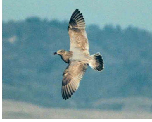
315 Hybrid Glaucous-winged x Western Gull / Beringmeeuw x Californische Meeuw Larus glaucescens x occidentalis, second calendar-year, Point Reyes, Marin County, California, USA, 12 November 1996 ( Jon R King ). Most of plumage is closer to Western Gull but note pale mantle and scapulars more close to Glaucous-winged Gull

Overall, juvenile Glaucous-winged Gull resembles juvenile Thayer's Gull but most are easily distinguished by obvious differences in size and structure. Thayer's is smaller and neater,